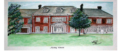
Circa 1914 Historic Gov. Thomas E. Kilby House 1201 Woodstock Avenue (Anniston)

P.O. Box 5097 Anniston, AL 36205 (256) 473-7707